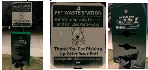
4 Pet Waste Stations at Jim Lee Park