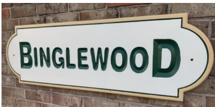
Binglewood Sign at Clay and McKean